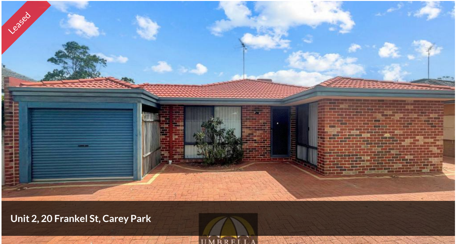
Unit 2, 20 Frankel St, Carey Park