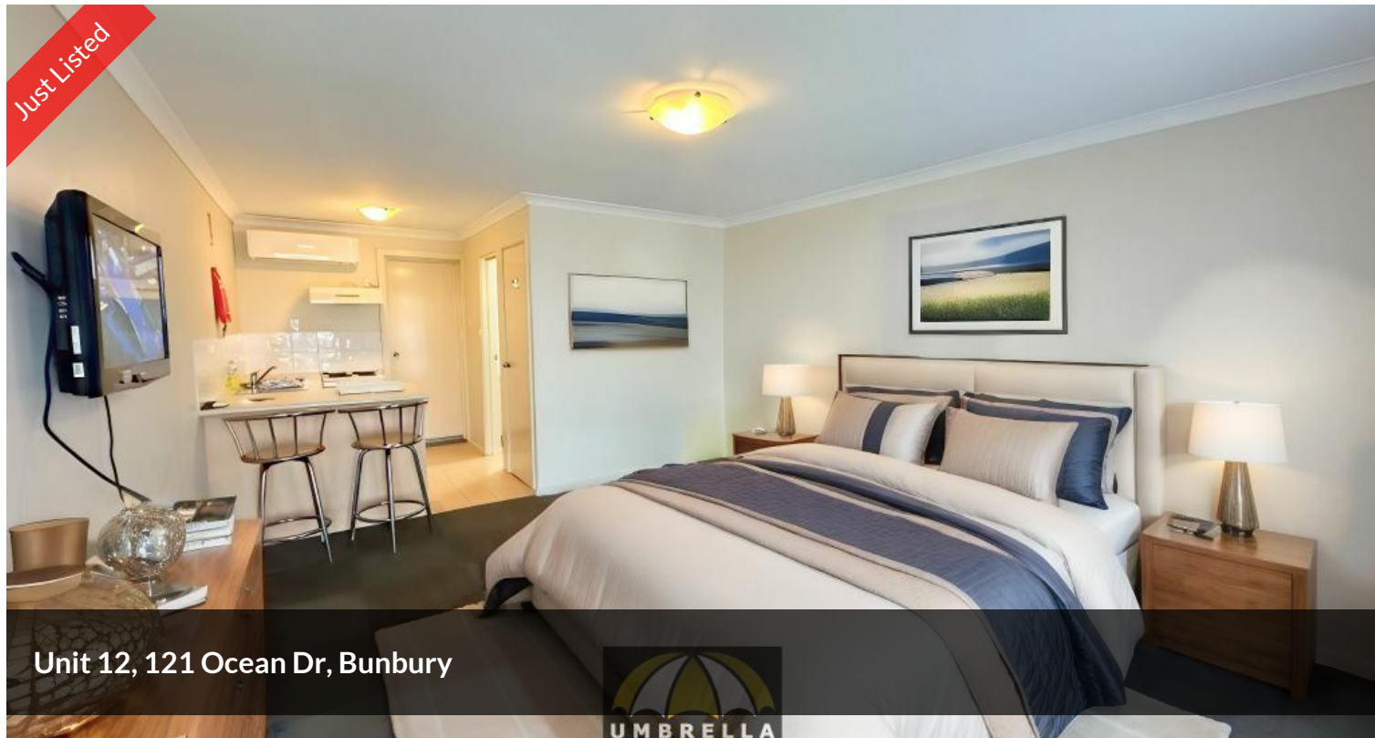
Unit 12, 121 Ocean Dr, Bunbury