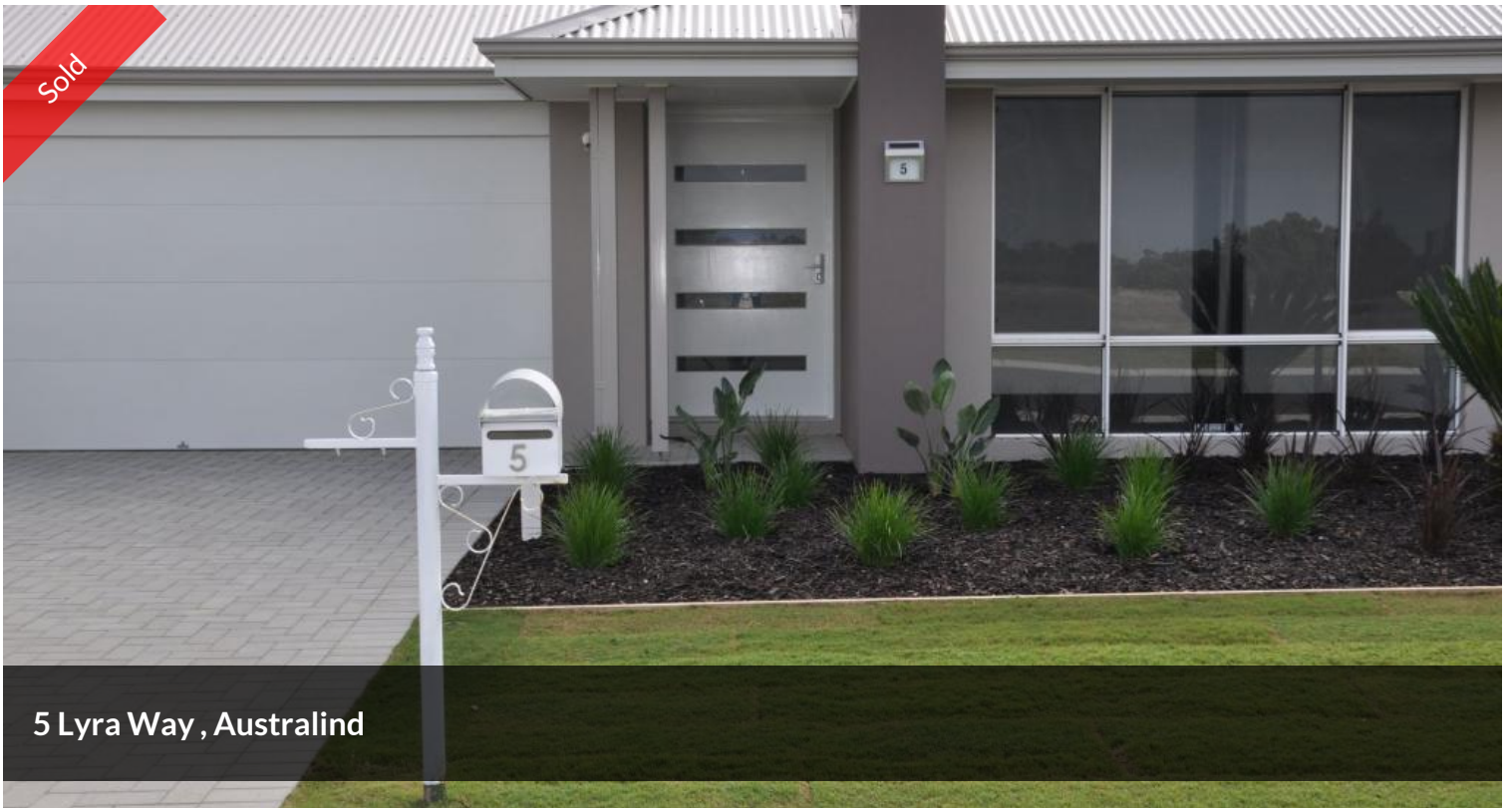
5 Lyra Way , Australind