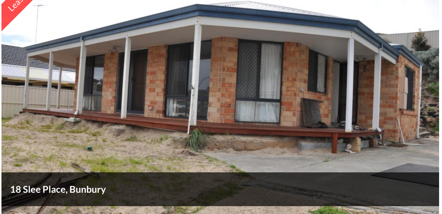
18 Slee Place, Bunbury