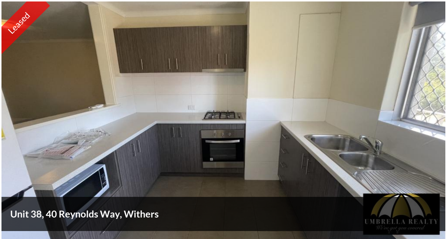
Unit 38, 40 Reynolds Way, Withers