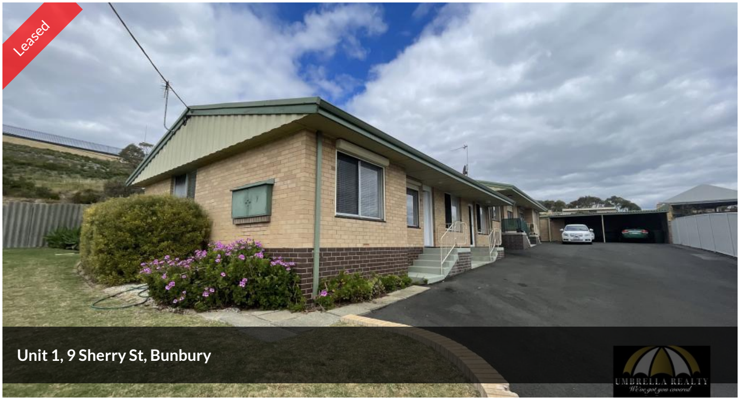
Unit 1, 9 Sherry St, Bunbury