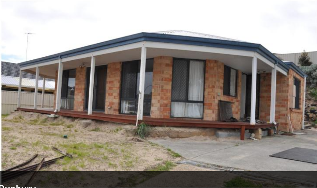
18 Slee Place, Bunbury