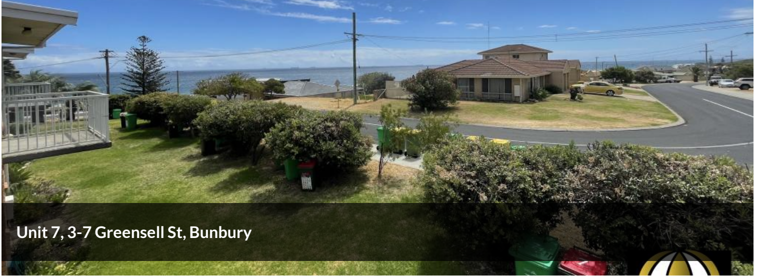
Unit 7, 3-7 Greensell St, Bunbury