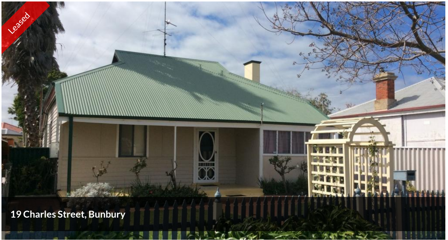
19 Charles Street, Bunbury