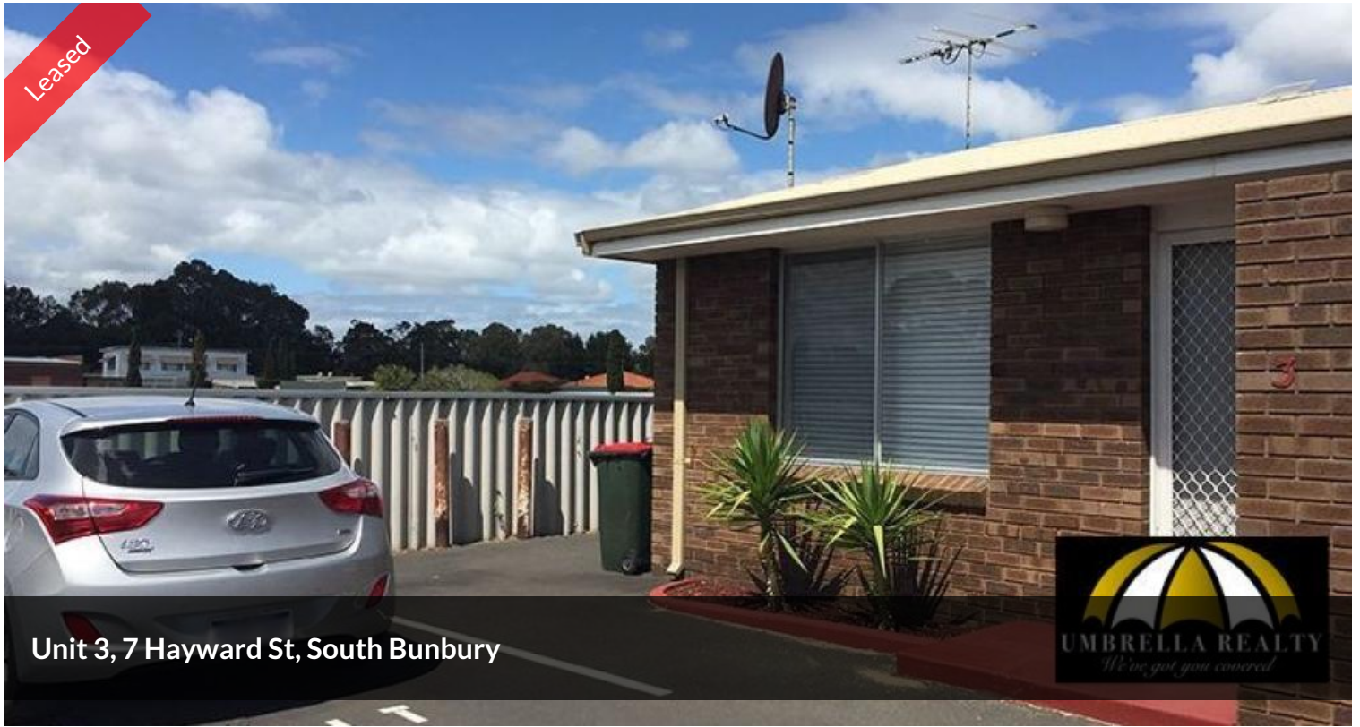
Unit 3, 7 Hayward St, South Bunbury