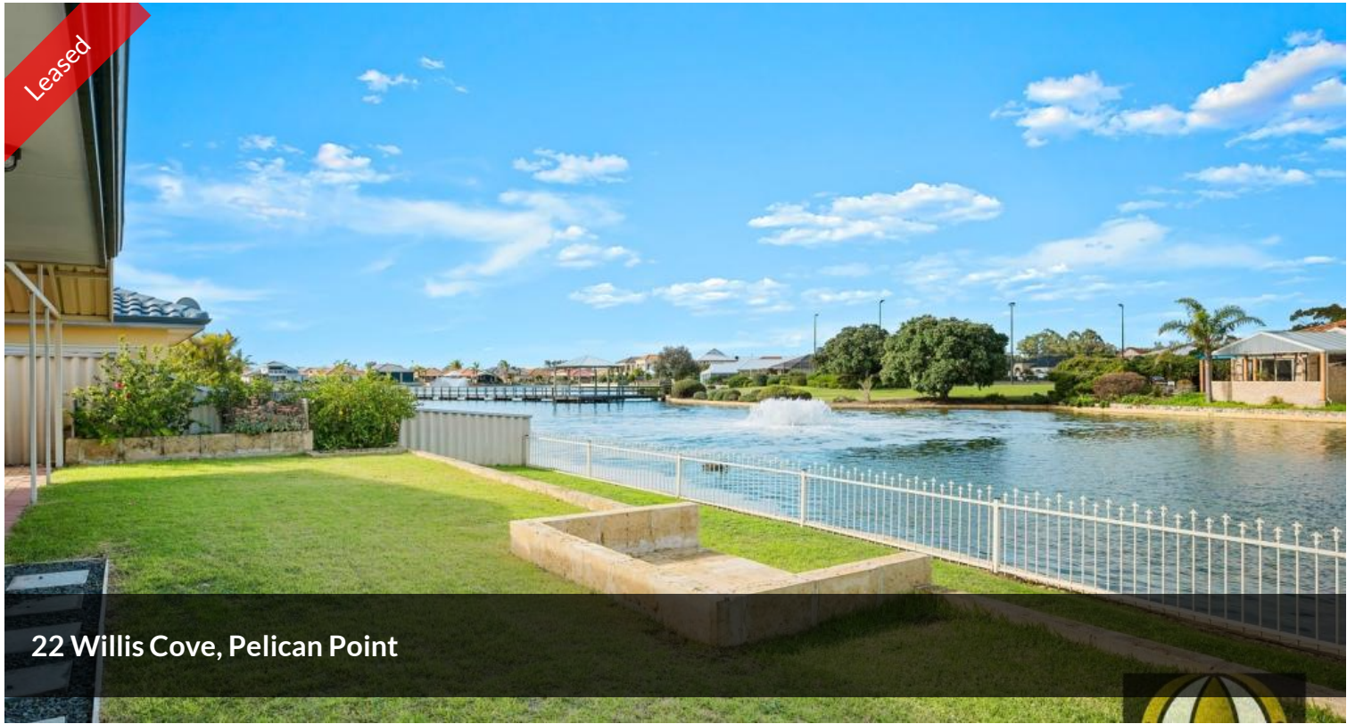
22 Willis Cove, Pelican Point